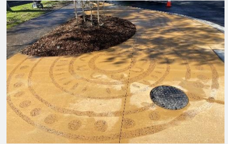
Works at Murray Street

The locations for the new raised pedestrian crossings on Graham Street are: