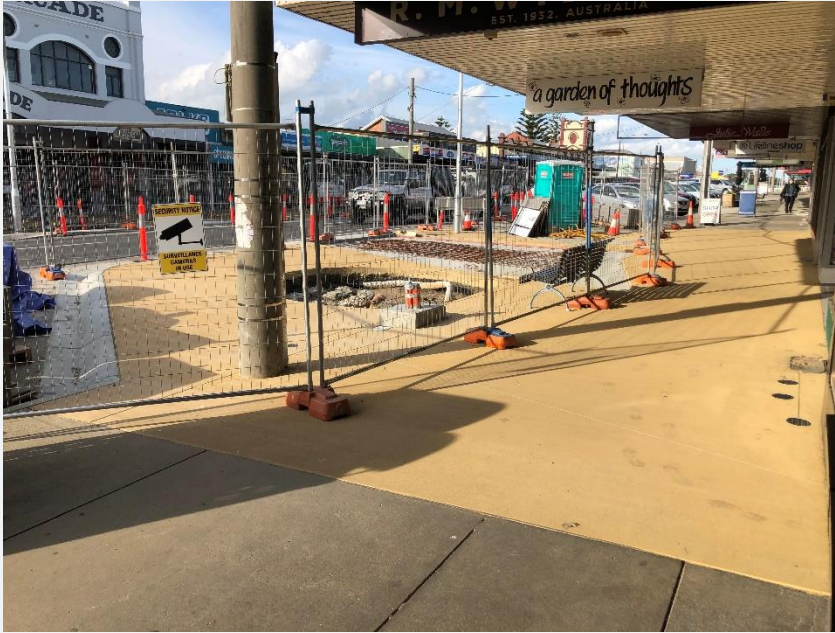
Works at Graham Street pedestrian crossing outside Plaza Arcade