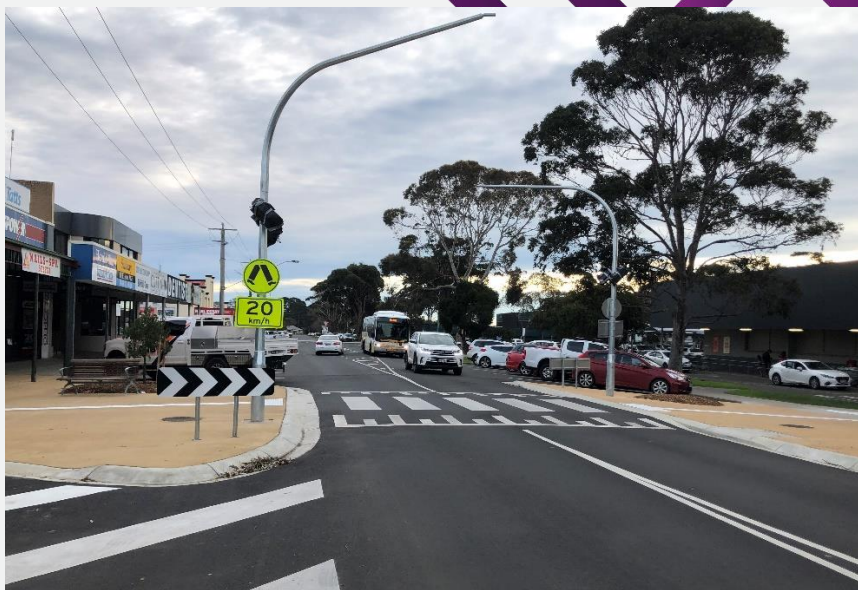
Works at Murray Street pedestrian crossing

We're creating and upgrading pedestrian crossings in Wonthaggi's CBD to improve safety for pedestrians.