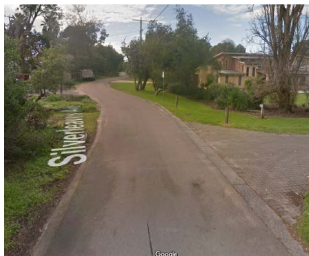
Meandering narrow road with no footpath and pavers at intersection, Silverleaves Ave, Silverleaves