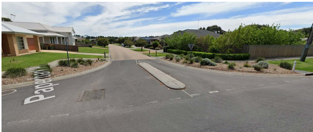
Intersection with splitter island, landscaping, connecting pedestrian paths and paved road in background at Paperbark Place, Inverloch