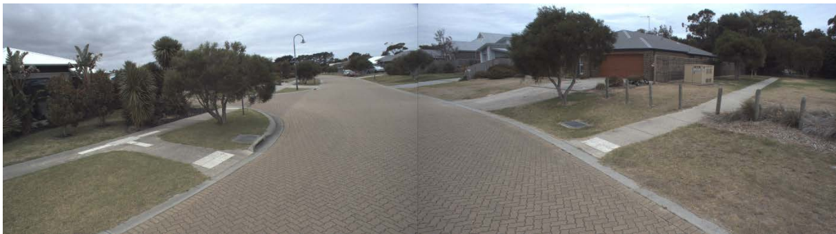
Paved road, drainage pits, connecting pedestrian paths at Paperbark Place Inverloch

Landscaping with textures and colours in more natural themes can enhance the street characteristics. Here are some examples: