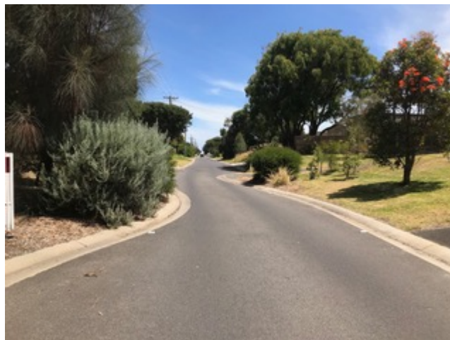
Curved narrow road with no footpaths at Cape Woolamai.