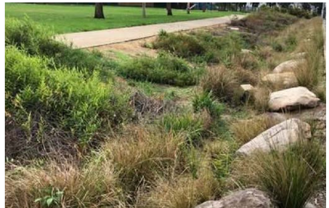
Swale channel