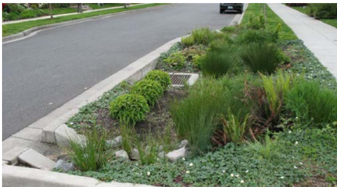
A raingarden