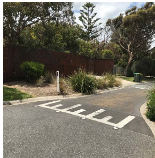
Slow point with landscaping at Woolamai West.