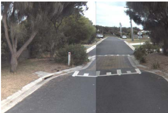
Landscaping nature strip that enhances the streetscape, Surfers Dr, Woolamai West

Landscaping speed slowing devices with textures and colours in more natural themes can enhance the street characteristics. Here are some examples: