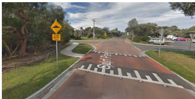
Intersection slow point at Surf Parade, Inverloch