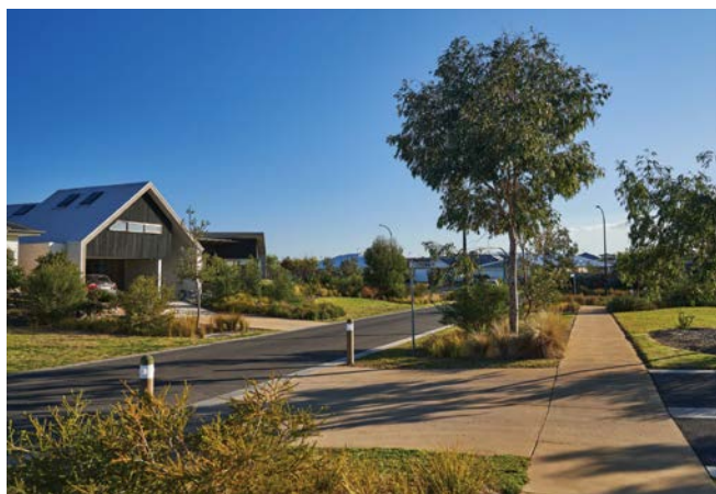
Concrete footpath and landscaping that enhances the natural look to the streetscape

Landscaping with different types of material, textures and colours in more natural themes can enhance the street characteristics. Here are some examples: