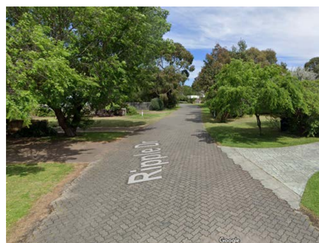
Road with pavers and no footpaths, Ripple Dr, Inverloch