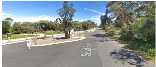
Landscaping, carparks, slow points and pedestrian crossing Surf Parade, Inverloch