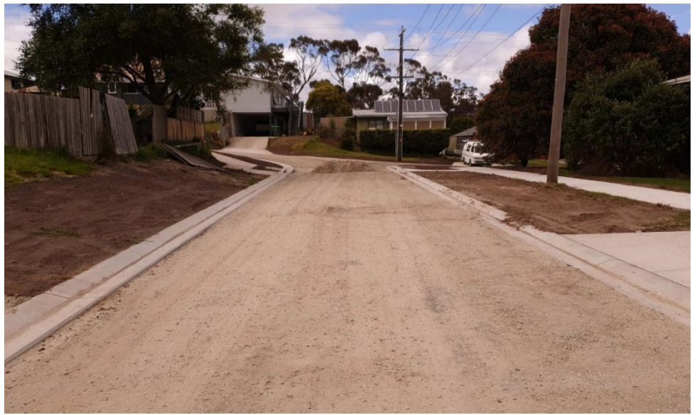
Alec Street preparing for asphalt

It is anticipated that works will be completed in mid-December 2021, subject to favourable weather, contractor availability and Covid-19 restrictions.