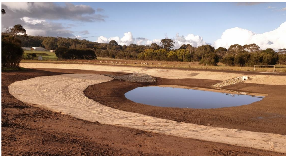
Construction of the Wetlands progressing

Due to poor weather and ground conditions our contractor has not been able to complete the scheduled works as expected. This has caused delays across the project.