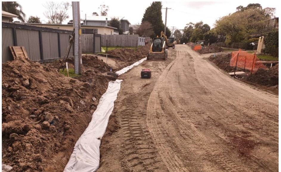
Boxing out in Helen Street

Please contact the Revenue Services team at Council to discuss your payment options.