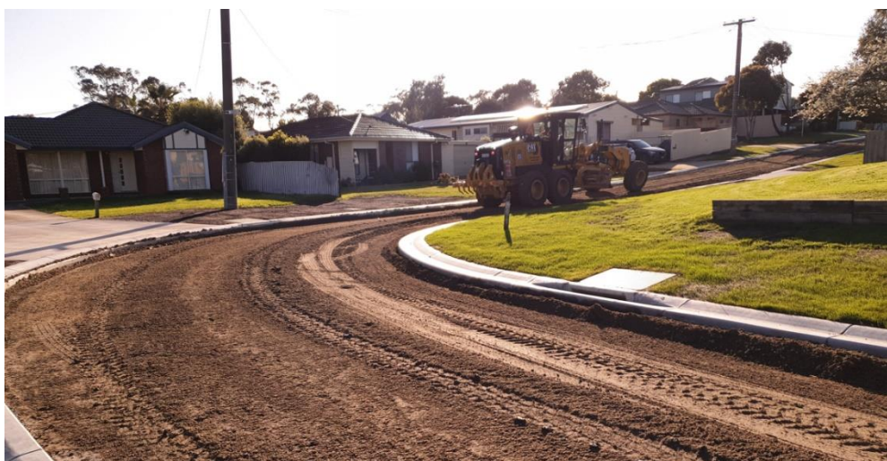
Placing base rock in Daisy Avenue

Jaydo, the contract for the Wetlands construction are nearing completion of their works. All drainage infrastructure works in the Wetland are completed with top soil. Vegetation works will commence in the coming weeks with the completion of the access tracks.