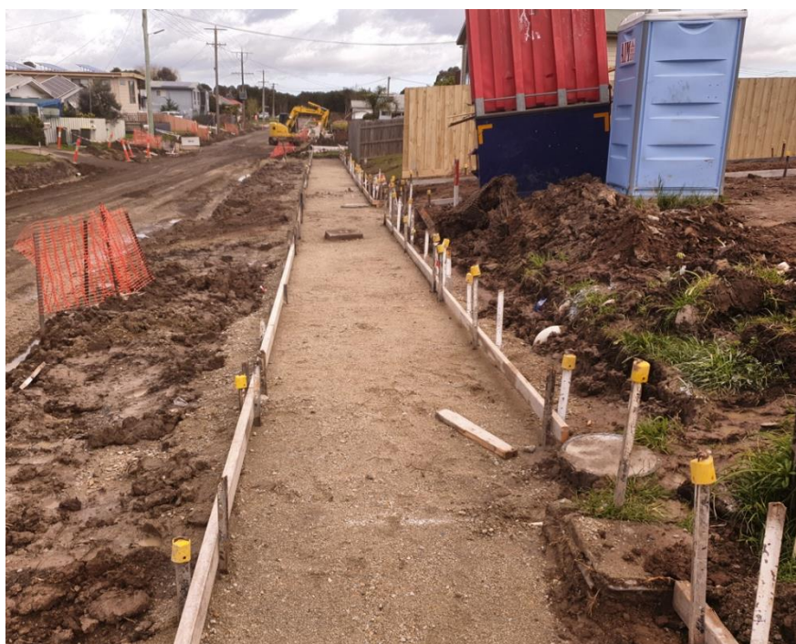
Footpath works in Kallay Drive