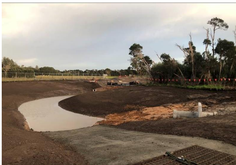
Sediment pond access ramp in Wetlands