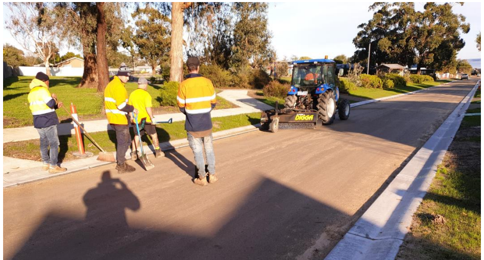
Brooming the road in Sonia Crescent before priming