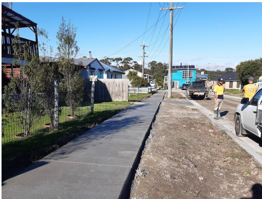
Footpath works in Sonia Crescent

Our Contractor, AWS Civil can be contacted on (03) 5998 3331. Kevin Chuck on 0418 353 622 or Slavik Silka 0422 166 359 or by email kevin@awscivil.com.au