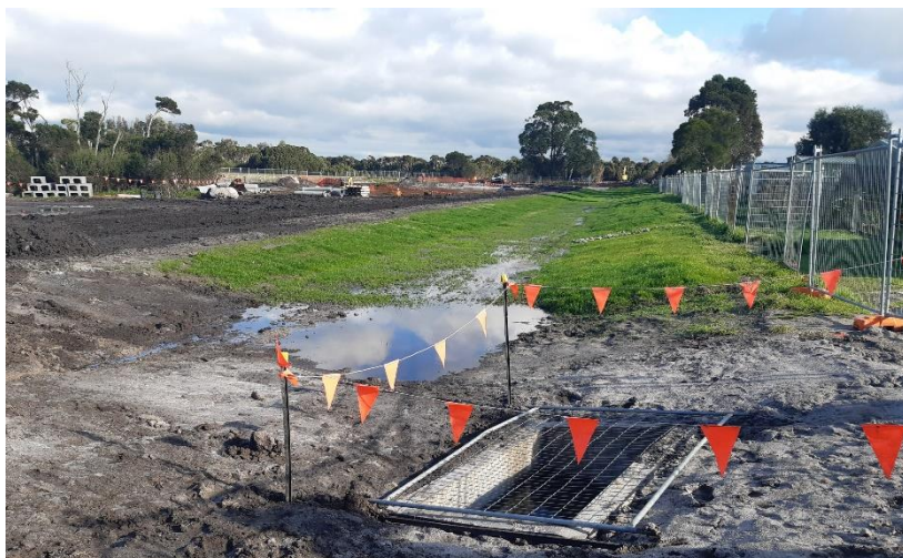
Diversion Pit in Wetlands partially completed