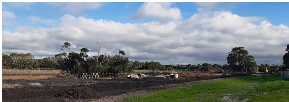
Progress of Wetland works at Pioneer Bay

Wetland Contractor, Jaydo have been hampered by poor weather, causing some delays in their works. Their works will continue until end of this month.