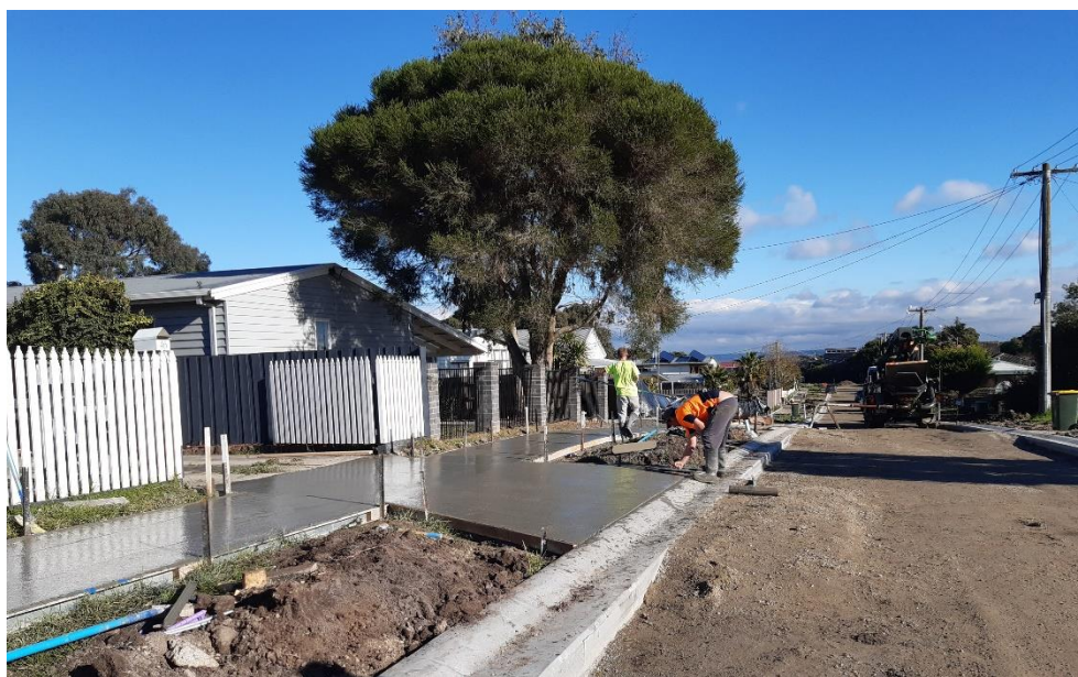
Footpath and driveway works in Sonia

Due to poor weather and ground conditions our contractor has not been able to complete the scheduled works as expected. This has caused delays across the project.