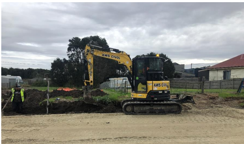
AWS laying the Agg. pipes in Whiting Street