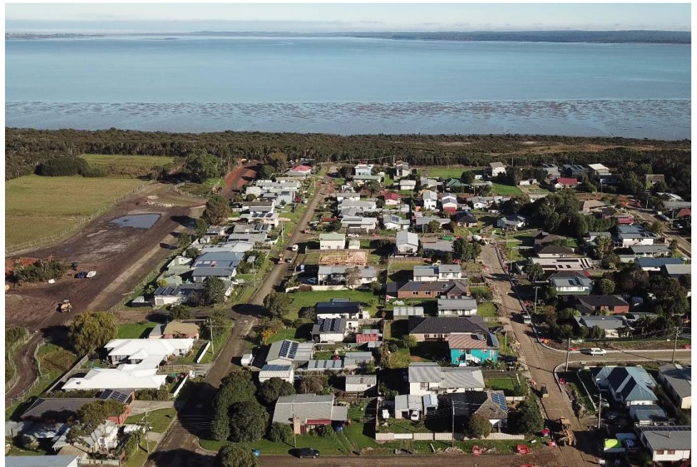
Aerial shot of Pioneer Bay

Installation of sheet piles within levee is now 95% complete. The clay liner within the wetland is 60% complete.