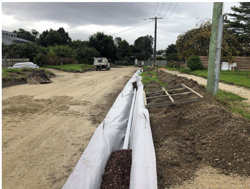
Aggy pipes being laid in Whiting Street

Our contractor will make every effort to minimise the impact of these works on the local community and we thank you for your patience.