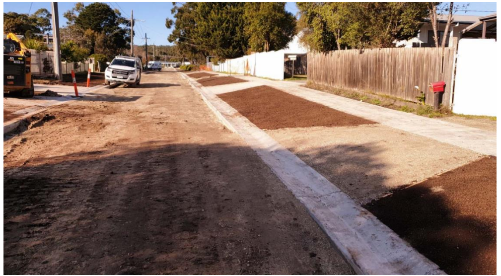
Footpath and crossover works in Sonia Crescent

Due to poor weather and ground conditions our contractor has not been able to complete the scheduled works as expected. This has caused delays across the project.