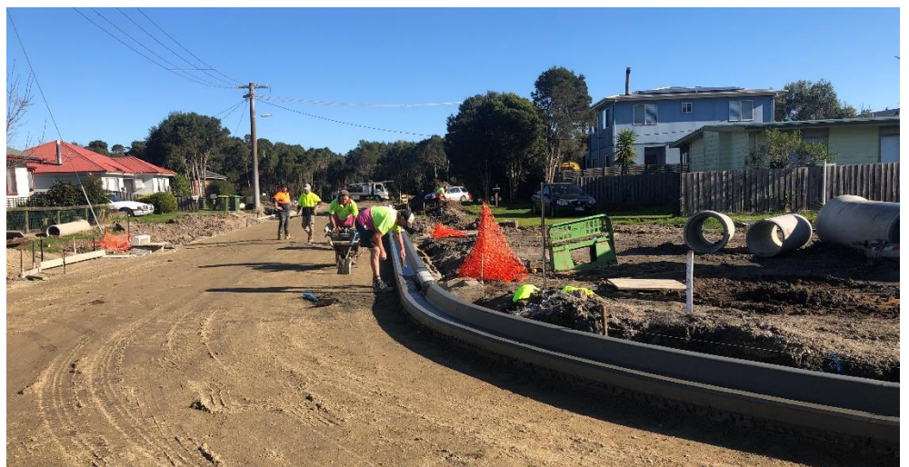
Construction of the kerb and channel in Kallay Drive

Wetland Contractor, Jaydo have been hampered by poor weather, causing some delays in their works. Their works will continue until the end of July.