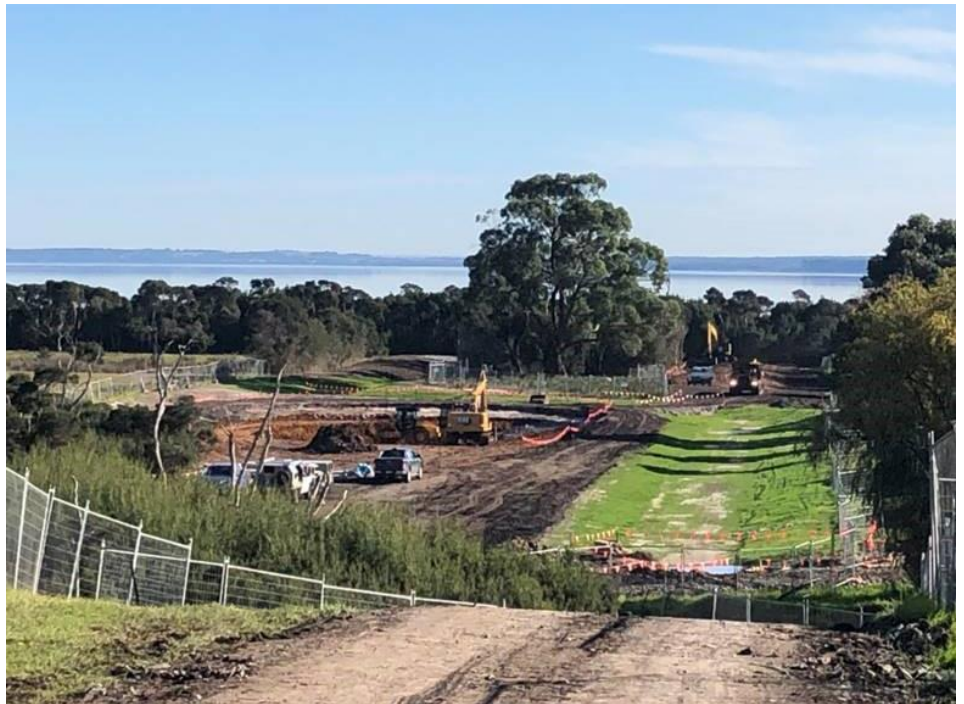
Progress of Wetland works at Pioneer Bay

Jaydo is still located at the end of Bream Street, continuing their wetland constructions works.