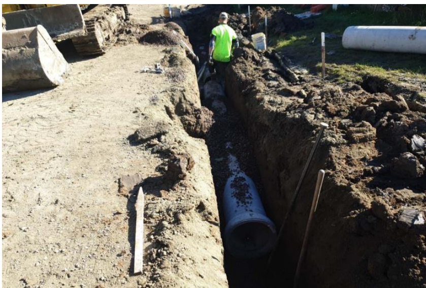
Drainage pipes being installed in Kallay Drive

Our Contractor, AWS Civil can be contacted on (03) 5998 3331. Kevin Chuck on 0418 353 622 or Slavik Silka 0422 166 359 or by email kevin@awscivil.com.au