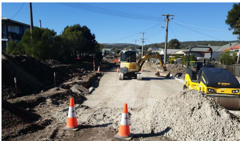
AWS completing subgrade improvement works in Kallay Drive at Western end