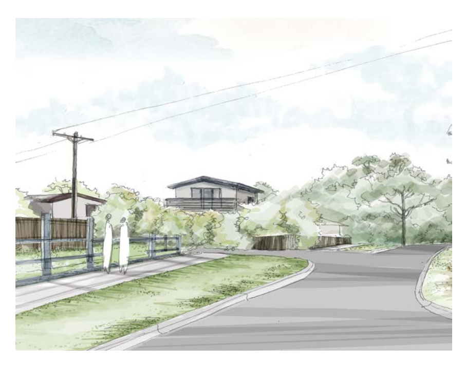
Pioneer Bay Landscaping Sketch looking East on Kallay Drive