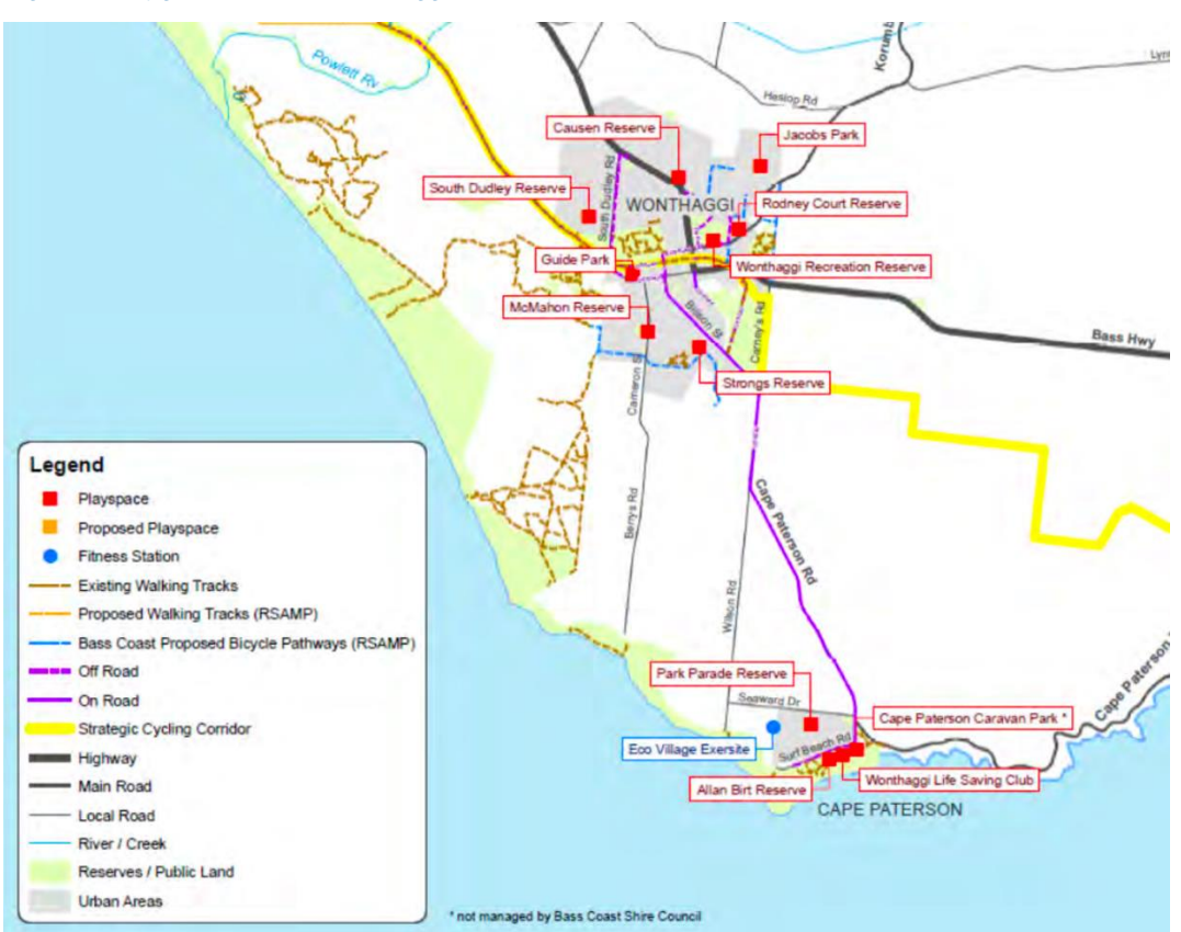
Figure 2 Playground Map - Wonthaggi

The key issue identified in the structure plan, was the inequitable distribution of open spaces in Wonthaggi North. This is expected to the partly addressed by the provision of open spaces under the PSP.