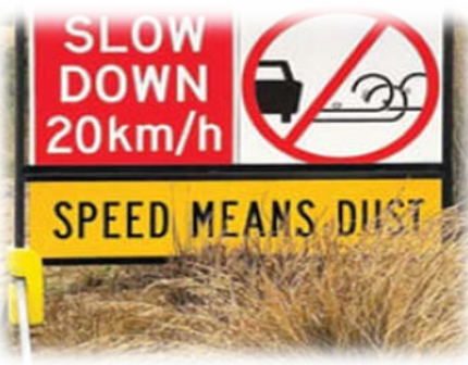
Please slow down on dusty roads

Driving slowly is important to reduce dust for nearby property owners, while also improving the safety of pedestrians who walk along the roads while there are currently no footpaths.