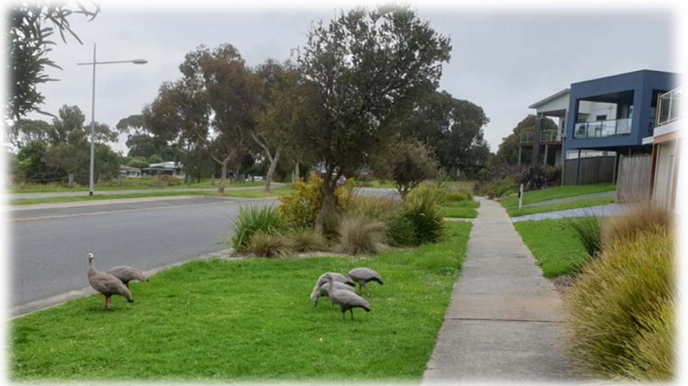
Urban swale drain example at Seagrove Estate, Cowes

Cost proportioning and individual costs per property owners will be developed and considered after the preferred concept plan is considered and adopted by Council which is scheduled for March 2023. Several options for cost proportioning must be considered to ensure costs are distributed in a fair and reasonable manner.