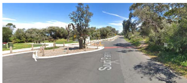
Landscaping, carparks, slow points and pedestrian crossing Surf Parade, Inverloch