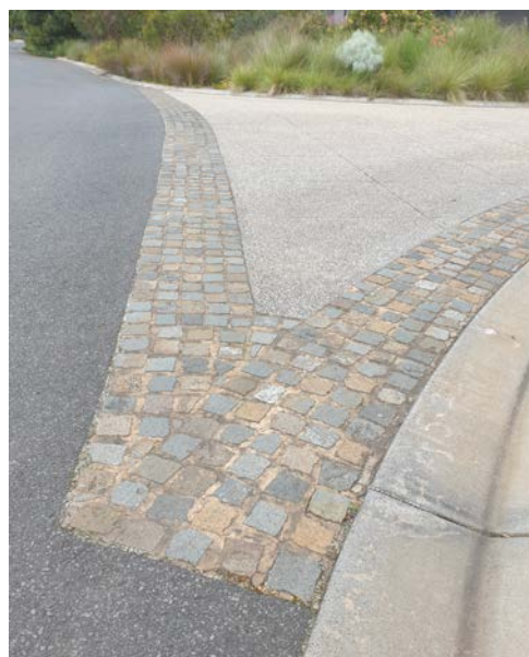
Intersection with threshold treatment, landscaping and swale drains in nature strip at Seagrove Estate Cowes.