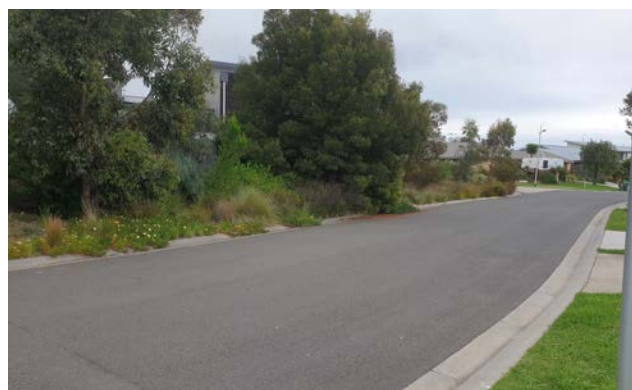
Well vegetated nature strip with swales drains, Seagrove Estate Cowes.