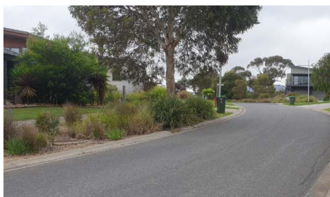
Vegetated swale and grate pit Seagrove Estate Cowes