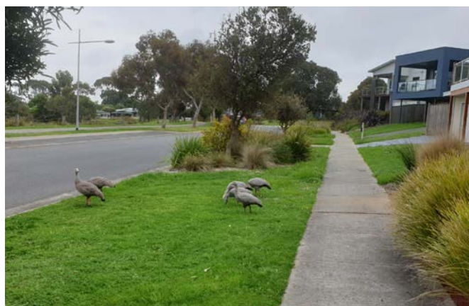
Swale channel at Seagrove Estate Cowes