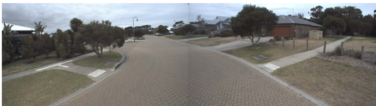
Paved road, drainage pits, connecting pedestrian paths at Paperbark Place Inverloch

Landscaping with textures and colours in more natural themes can enhance the street characteristics. Here are some examples: