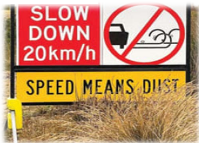
Reminder to slow down to reduce dust

Council will soon install the temporary warning signs again in anticipation of dryer conditions when dust is more of a concern.