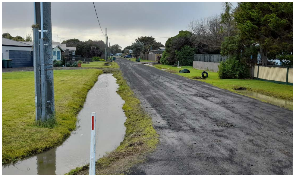
Jill Street after heavy rains in June

There was generally a response to select minimal cost options and this will be considered in development of the concept plan options.